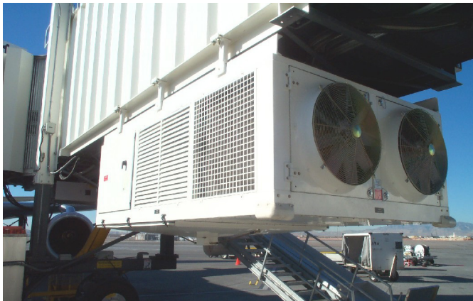
Model DXU45 Bridge Mounted