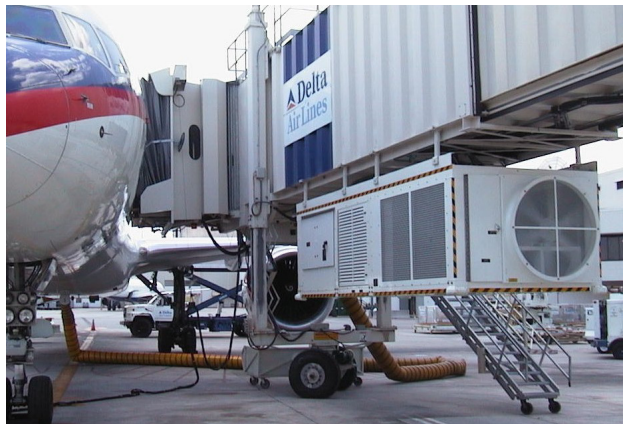
Model DXU90 Bridge Mounted