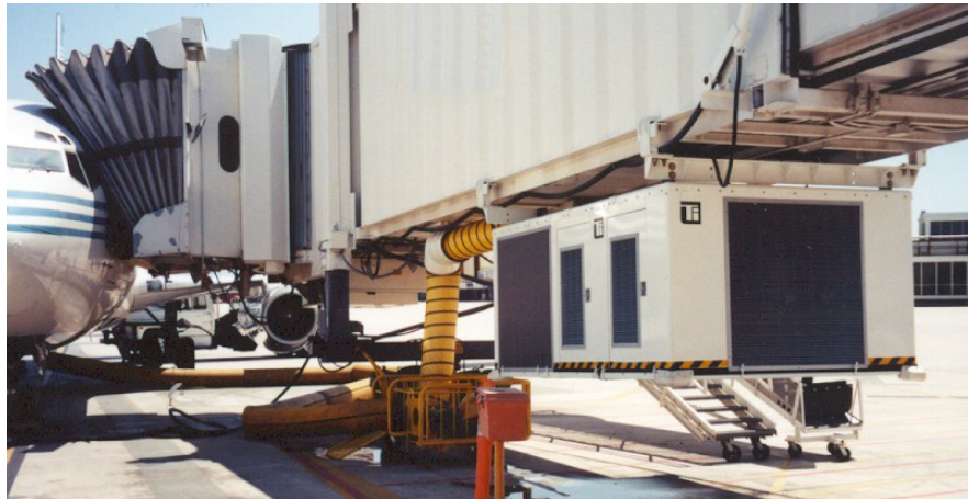
Model POU20 Bridge Mounted