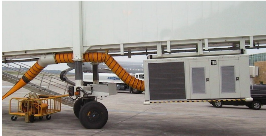
Model POU300 Bridge Mounted